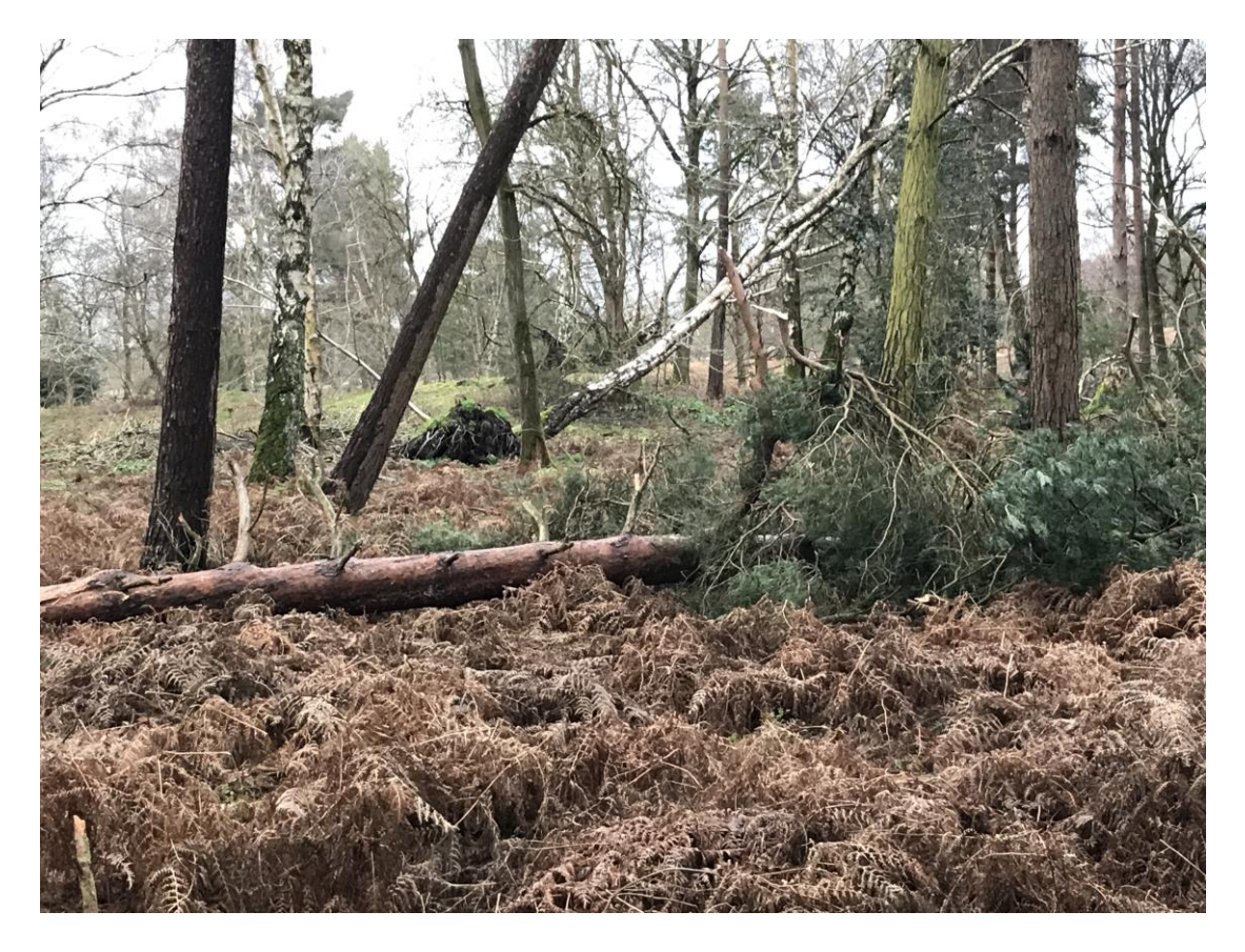
Above: The results of mechanical forest thinning - the inner trees are not able to withstand the sudden increase of wind exposure.

The presence of the ponies will help facilitate this change, as described both by SWT and WREN (2). Grazing animals are not a woodland's friend. They will do damage to existing trees and they will stop young trees from growing. We have seen already the effect of sudden wind exposure and the resulting continuing tree loss in the opened areas. The plan of SWT for the remaining wooded areas in the enclosure is gradual death – those areas will become so open that they do not resemble a woodland anymore.